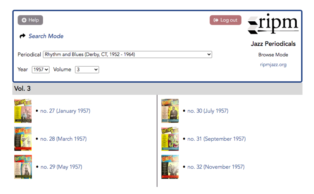
Figure 1: RIPM Jazz – Browse Mode

While the Basic search includes a single search box for key words, the Advanced Search offers useful limiters, as seen in Figure 2.