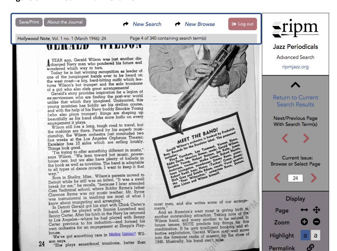
Figure 3: RIPM Jazz - Full-Text View

to institution. As seen in Figure 3, these features are clearly displayed, and make the database extremely user-friendly.