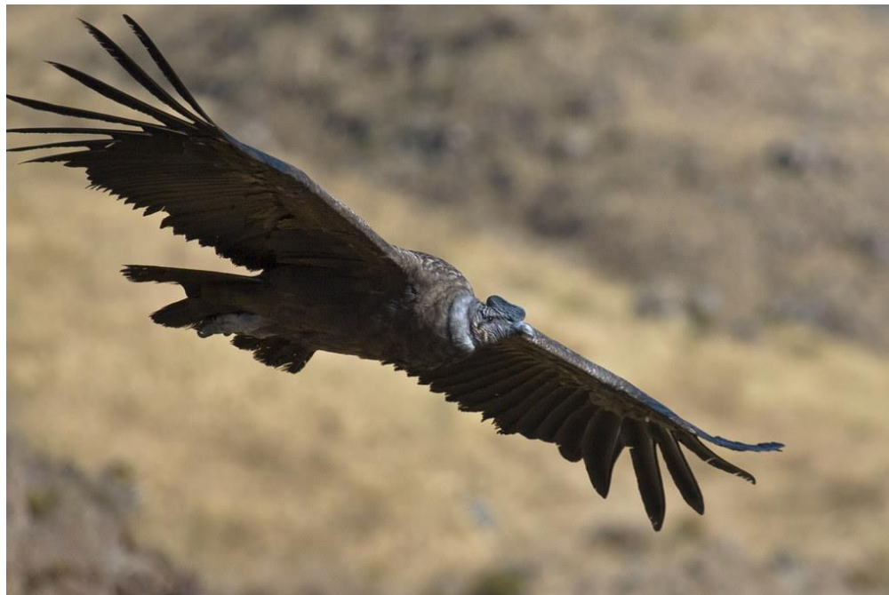
Figure 4. Vultur gryphus or Andean condor. 41

Finally, the vocalist chose to represent the Andean condor ( Vultur gryphus , see Fig. 4), the national bird in many Andean countries. While growing up in Ecuador, we were continuously educated in how majestic the bird is and warned of its risk of extinction. 39 These facts are so pervasive in our Andean cultures that the reasons ascribed to its selection corroborated it. It was mentioned that the majestic qualities, symbology, mythology, and Andean folklore were the reasons that drove the relationship with the bird. Musically, the vocalist reflected his task as needing to add a top layer that would be as powerful as the selection. He shared his process of listening to the sounds of the condor first to know what dimension of the bird to portray. As opposed to the instrumentalists, who relied on representation in their musical contributions, Víctor chose replication. The vocals of the condor were to be imitated through more aggressive vocal techniques. Some coherence was achieved in his replication, but like Sofía, he also added a melodic layer driven by a need to pierce through the musical textures. Knowing that the condor is among the largest flying birds in the world, 40 the use of a high vocal range was mandatory. He further reflected on how once he heard the recording, it also brought him feelings of agony. Something that related with his experiences of seeing this bird in captivity, depressed, and unable to fly.