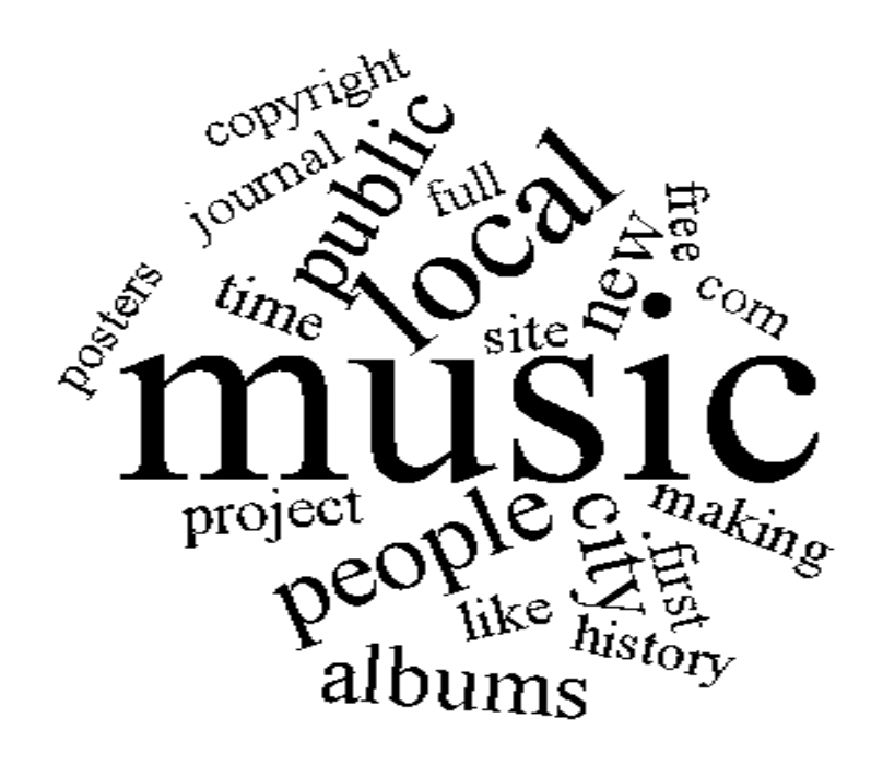
Figure 3: Top 20 words, from the selected documents, in newspapers