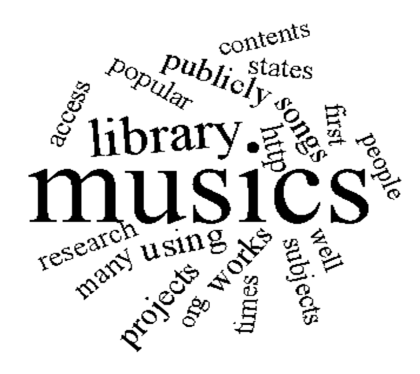
Figure 2: Top 20 words, from the selected documents, in all sources excluding newspapers