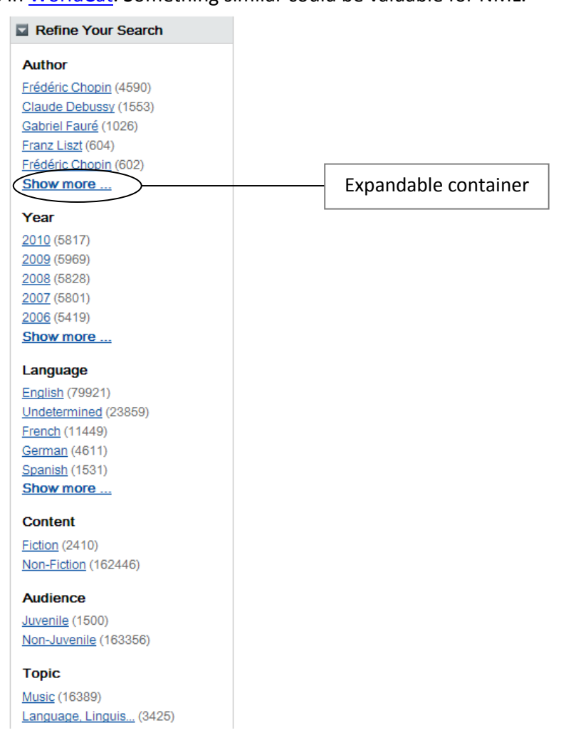
Figure 2: An example of expandable containers in WorldCat

One may argue that faceted classification is not appropriate for an online library with as much content as NML; facets can lose their effectiveness when there are too many refinement options. There is some validity to this argument; however, instead of offering limited opportunity for refinement, and leaving the user with a barrage of unorganized search results, the system could be enhanced by providing expandable containers. WorldCat illustrates how expandable containers can handle substantial content. The screenshot example provided (see fig. 2) illustrates options for refinement in a search for nocturnes in WorldCat. Something similar could be valuable for NML.