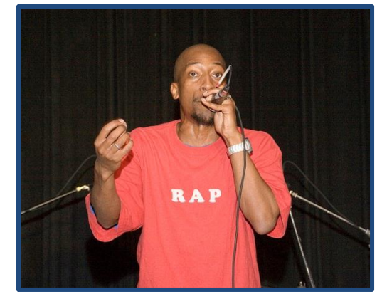
More or Les at the North York Central Branch Make Some Noise, Nov. 3, 2007

TPL has been further encouraged by discovering other library systems around North America that have started similar initiatives, either on their own or using TPL as a model.