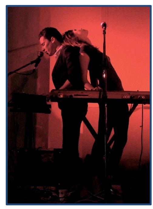
The Magic at the North York Central Branch Make Some Noise, Nov. 20, 2010

The Guelph Public Library held a local music event in July 2011, and kindly credited TPL's Local Music program as an influence in their planning. The Greater Sudbury Public Library has also started inviting local musicians to play in their branches, and is building connections with media outlets and retailers to promote their efforts. Finally, south of the border, the lowa City Public Library (in a move perhaps divining things to come) has started an online, downloadable collection of recordings by local musicians, available for free to any card-holding member of their community.