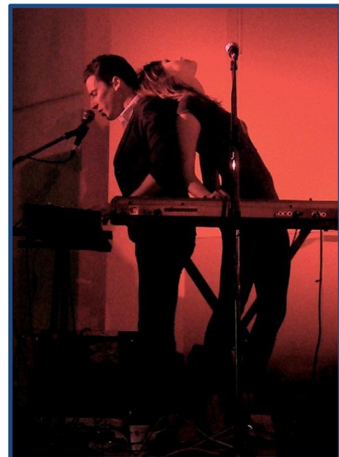
The Magic at the North York Central Branch Make Some Noise, Nov. 20, 2010