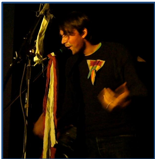
Bruce Peninsula at the North York Central Branch Make Some Noise, Nov. 7, 2009