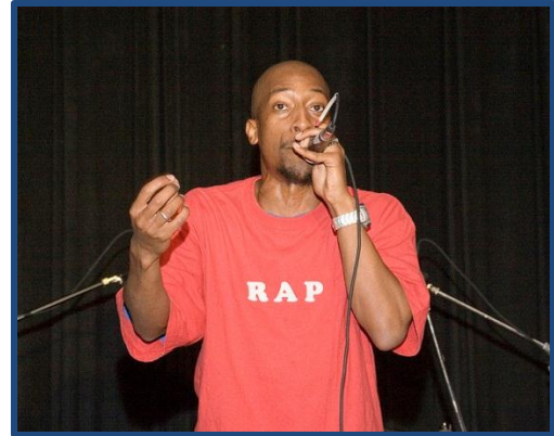
More or Les at the North York Central Branch Make Some Noise, Nov. 3, 2007

The Guelph Public Library held a local music event in July 2011, and kindly credited TPL's Local Music program as an influence in their planning. The Greater Sudbury Public Library has also started inviting local musicians to play in their branches, and is building connections with media outlets and retailers to promote their efforts. Finally, south of the border, the Iowa City Public Library (in a move perhaps divining things to come) has started an online, downloadable collection of recordings by local musicians, available for free to any card-holding member of their community.